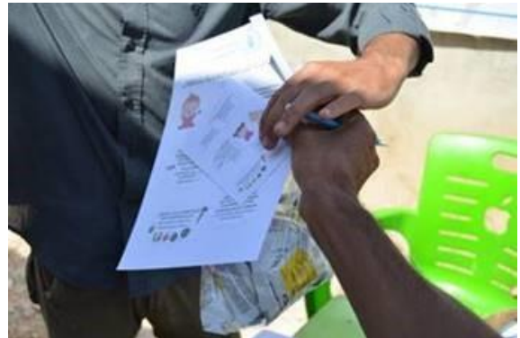
Provision of Nutrition Assistance in north-western Syria