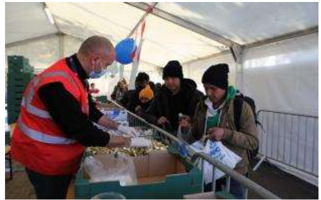
Provision of food items to migrants in the Reception center of Dobova.

Regional Disaster Response Team (RDRT) member has been deployed for one month in December 2015 for one month in support to the National Society focusing on building strong volunteer management and planning the future development of the operation, with a second visit in 2016, aimed at facilitation of trainings for volunteer and staff.