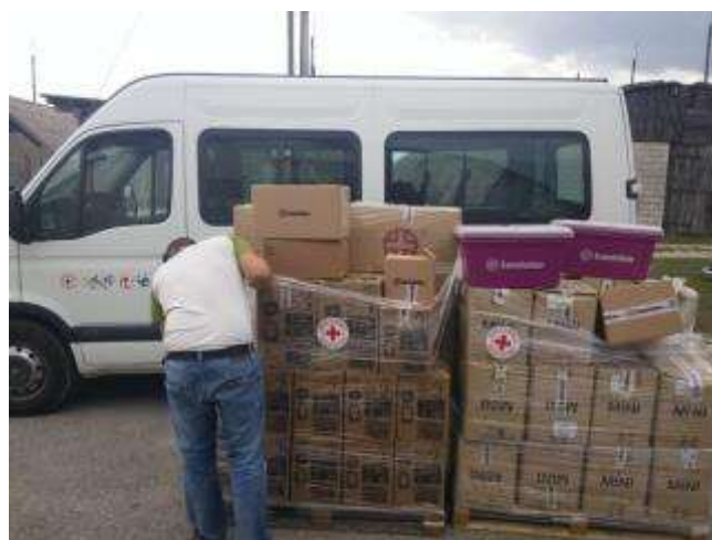
Logistical preparations before transporting the relief items to the centres.

During the procurement processes, the adopted rules and regulations were used. The Slovenian Red Cross's 'Regulations on Purchase and Sale' (adopted in 2011) governs the procedures for the procurement of goods, works and services in the Slovenian RC. The regulations are in line with the in-country legal requirements and are introducing three different types of procedure depending on type of procurement (services, goods, and works) and the value of single order or purchase.