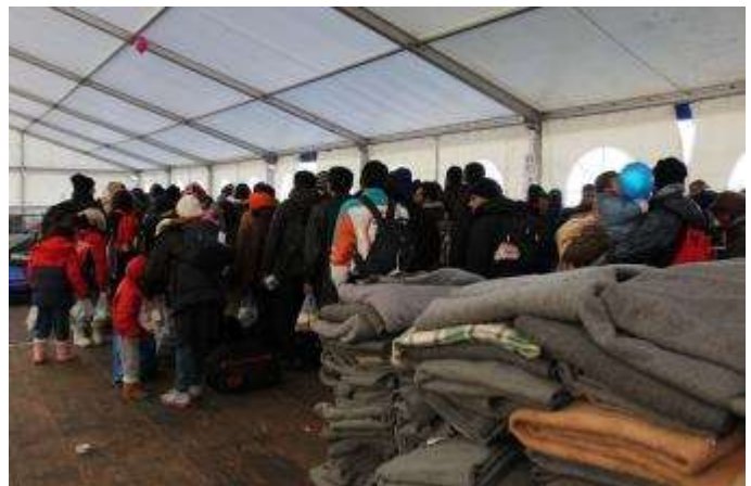
Receiving migrants in the accommodation center in Šentilj, Slovenia.

During the first few weeks of migrant crisis in Slovenia, the situation in the field has been extremely challenging. The sheer number of migrants crossing the country and in need of assistance, lack of experiences in state bodies and in humanitarian organizations about management of such large scale humanitarian disaster, lack of proper shelter items and equipment and diminishing stock of supplies in the warehouses of humanitarian organizations, have caused difficult conditions both for the migrants and for the persons, providing assistance to them. The speed of the migrant