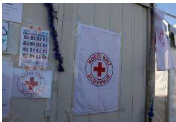
RFL point in the reception centre of Dobova.

The Slovenian Red Cross is organized in a decentralized way, we have 56 local branches in Slovenia, grouped in 12 regional branches that form national organization, which is headed and supported centrally via a head office in Ljubljana. The network currently employs 100 staff members locally and regionally, and 15 staff members located at head office. Out of the 56 local branches (LBs), seven branches have been involved in direct assistance to migrants. The main share of activities linked to the support to migrants has been conducted by LB Maribor and LB Brežice, with the support from neighbouring LBs.