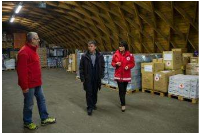
Visit to one of the NS warehouses.

Some purchases were implemented under the long term contracts, as the Slovenian Red Cross signed some purchase contracts before the beginning of crisis, with the duration of contract period long after completion of DREF operation. In these cases these contract were respected.