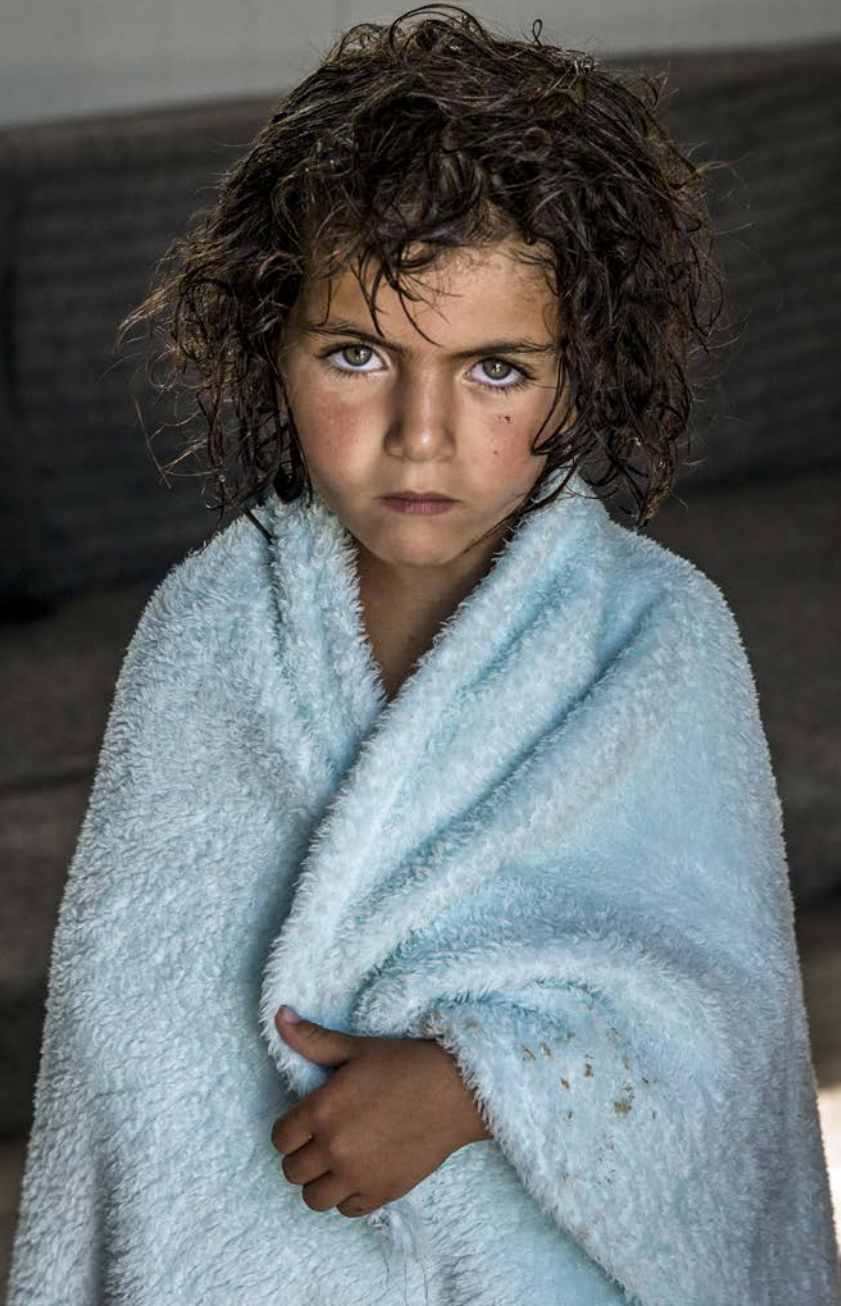
Portrait of a young Syrian refugee taken in her mobile home in the Za'atari refugee camp in Jordan.