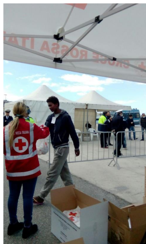
Italian Red Cross volunteer providing relief aid to an incoming migrant.

Due to the current situation and in the anticipation that the influx of migrants during the upcoming months will increase, the Italian Red Cross will continue its work to cover the continuing needs for food, drinking water and non-food items, first aid and health screening, psychosocial support (PSS) and restoring family links (RFL). This operations update no.3 has the objective of a timeframe extension from 31 May to 31 August 2016 with no changes in the budget at this time. The Italian Red Cross is currently revising the emergency plan of action in order to adapt to the increasing influx of migrants during the coming months. A revised plan of action and budget will be available in June 2016, with an additional operational timeframe extension , that will include the expansion of the Safe Point model throughout the entire Italian territory and the provision of primary health care and humanitarian assistance including search and rescue activities.