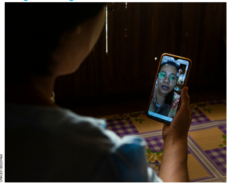
A pregnant woman receiving online health counseling service via mobile phone as a part of the UNICEF Bright Start pilot programme in Yangon, Myanmar