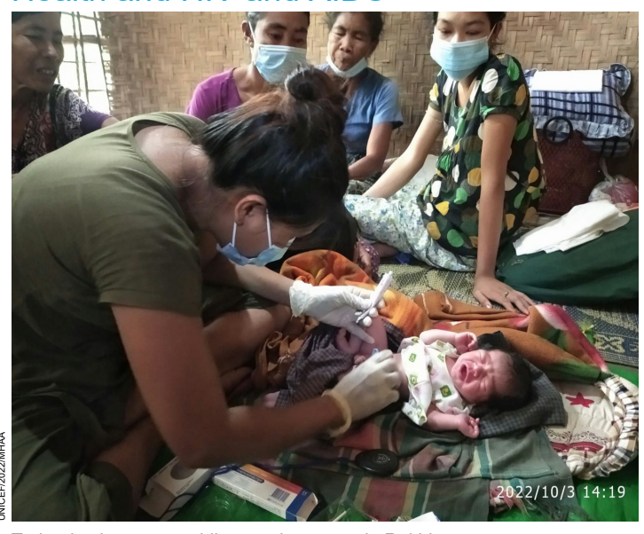
Trained volunteer providing newborn care in Rakhine state

In 2022, UNICEF and its 13 health programme partners (including private sector general practitioners) reached 458,141 with primary health care services through mobile and fixed clinics and outreach services in Rakhine, Kachin, Shan, Kayin, Kayah, Sagaing, Chin, Bago, Mon, Tanintharyi and peri-urban Yangon. During the year an increase in health needs, and primary health care consultations has led to exceed the health HAC annual target.