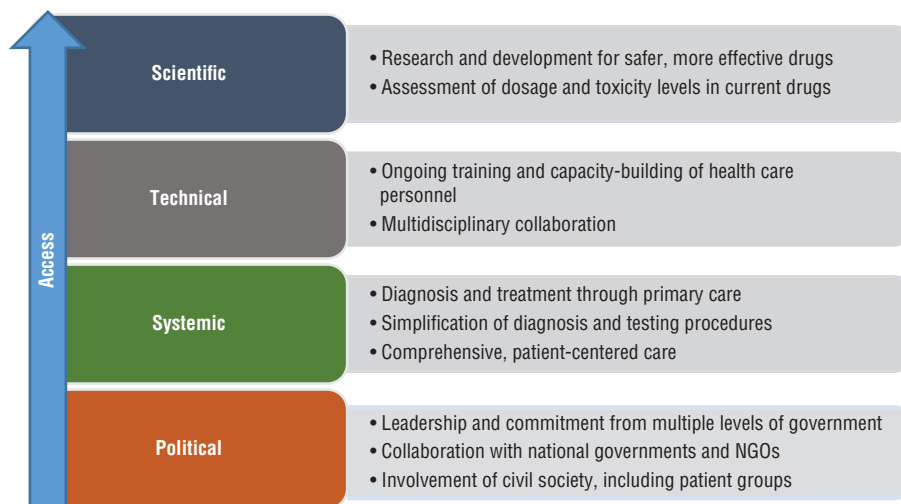
FIGURE 2. Core ingredients for increasing treatment access for patients with Chagas disease