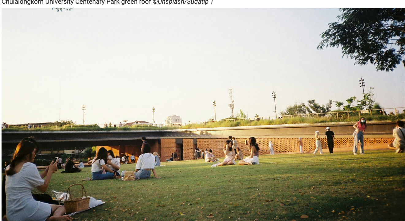
Chulalongkorn University Centenary Park green roof