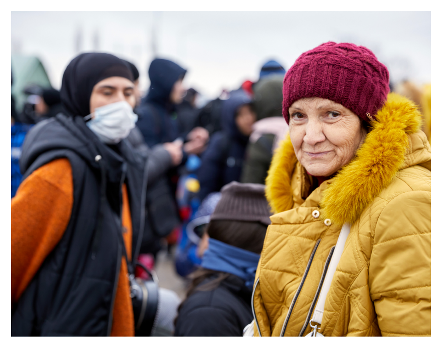
A scene from the Palanca-Maiaki-Udobnoe border crossing point, between the Republic of Moldova and Ukraine on 4 March 2022.

Governments; international, national and local organisations and communities continue to assist people arriving from Ukraine.<sup>19</sup> However, local civil society organisations (CSOs), women-led organisations (WLOs), women's rights organisations (WROs), non-governmental organisations (NGOs), refugee- and diaspora-led organisations and volunteers are at the forefront of the response in Ukraine and in countries supporting the refugee response.<sup>20</sup>