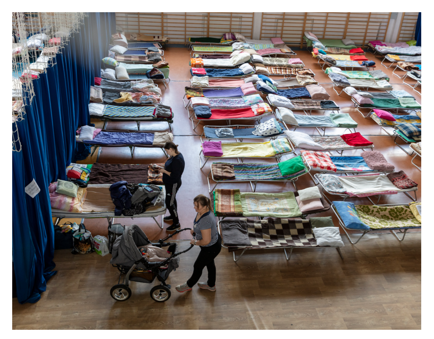
A school gym, Hala Sportowa, Przy Szkole Podstawowej, serves as temporary housing for refugees in the Polish border own, Hrebrenne. Photographed on Monday, April 11, 2022.

The analysis highlights that serious challenges and concerns related to SRHR must be resolved in the humanitarian and refugee response and that concerted attention and action are vital to addressing the SRHR needs of people affected by the escalation of the war in Ukraine. Although there are context-specific differences, the analysis reveals three main trends across the region. First, donor efforts must centre sustainable, flexible, long-term, institutional financial support for national WROs and SRHR organisations at the heart of their humanitarian and refugee response plans. Second, pre-existing legal and policy barriers on SRHR are severely limiting efforts to ensure an effective response to the SRH needs of refugees in some countries. Third, the escalation of the war has created supply chain and infrastructural constraints that continue to undermine SRH service delivery in Ukraine.