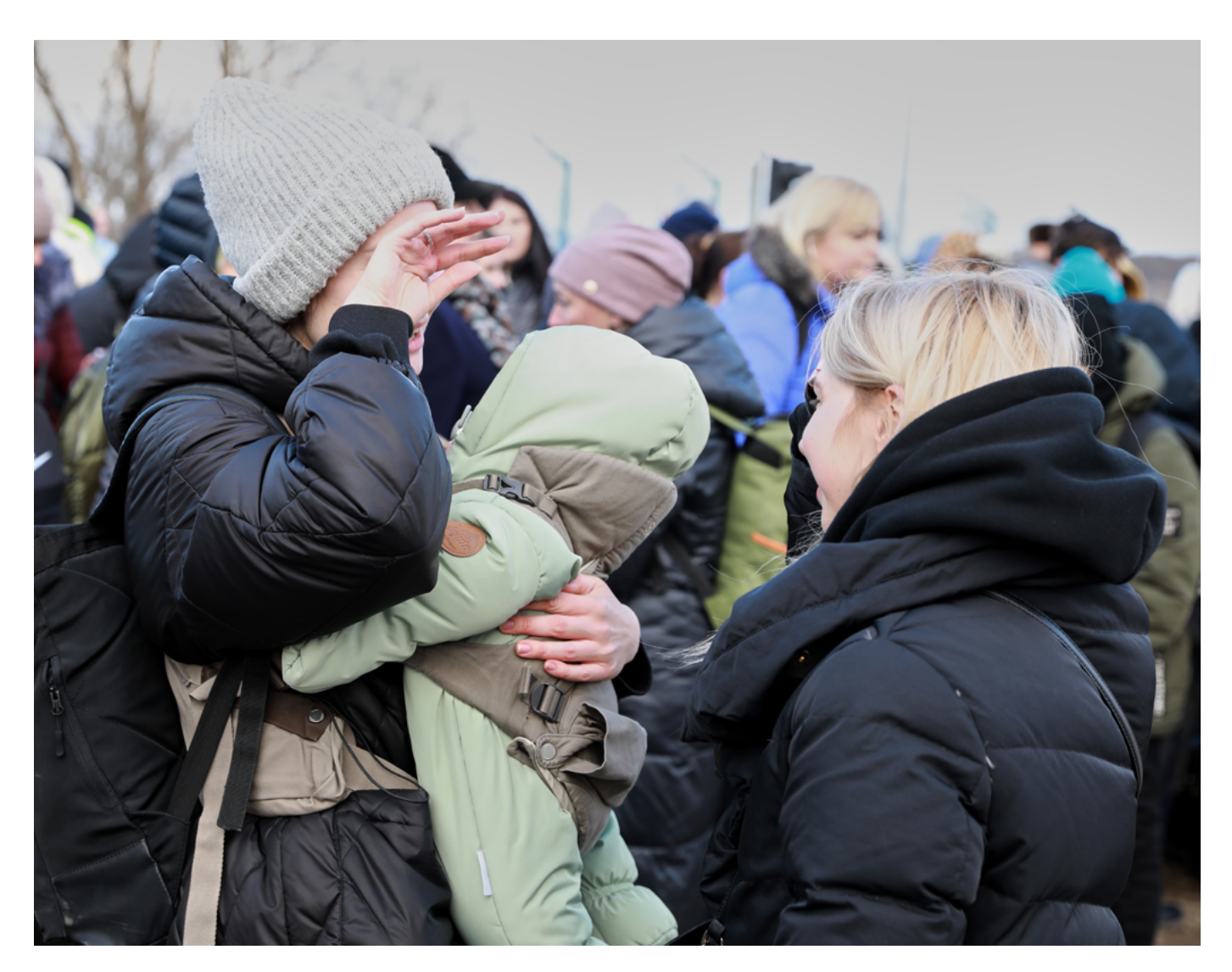
A scene from the Palanca-Maiaki-Udobnoe border crossing point, between the Republic of Moldova and Ukraine on 4 March 2022.