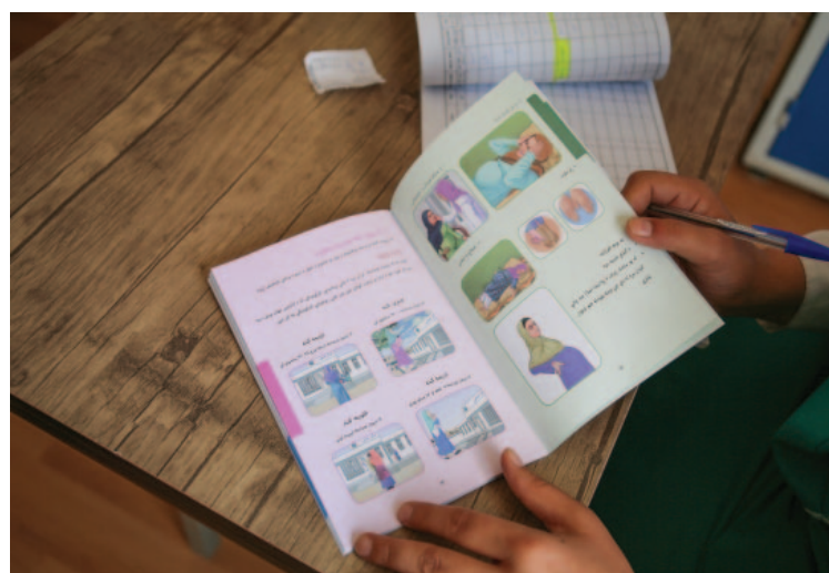
A midwife discusses family planning with a patient at Kahdistan clinic in Herat province, Afghanistan in October 2020. The health workers at Kahdistan clinic teach reproductive health and family planning methods using picture books as most of their patients cannot read. Each patient receives a book that is marked with their contraception instructions.

A midwife sees her first patient of the day at Kahdistan clinic in Herat province, Afghanistan in October 2020. The clinic previously offered pregnant women ready-to-use therapeutic food, but a limited supply this year caused by funding gaps means that now only the most severely malnourished pregnant women receive this assistance.