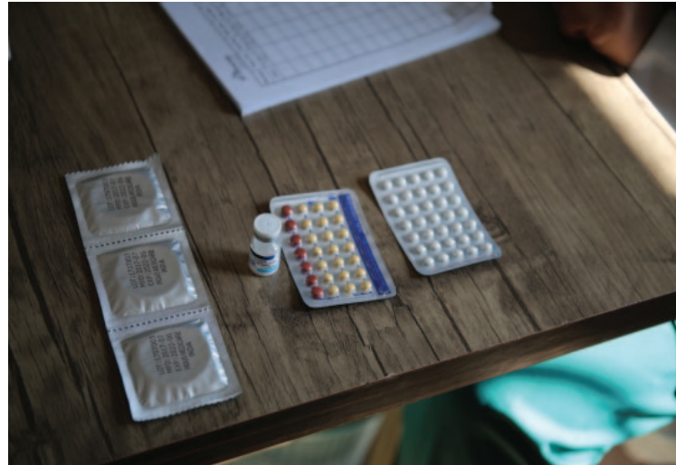
A midwife talks with a patient about family planning options at Kahdistan clinic.