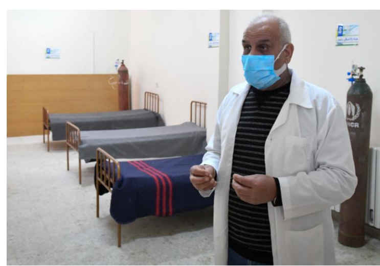
UNHCR equipped a special COVID-19 ward in a primary health care facility in rural Homs, Syria.