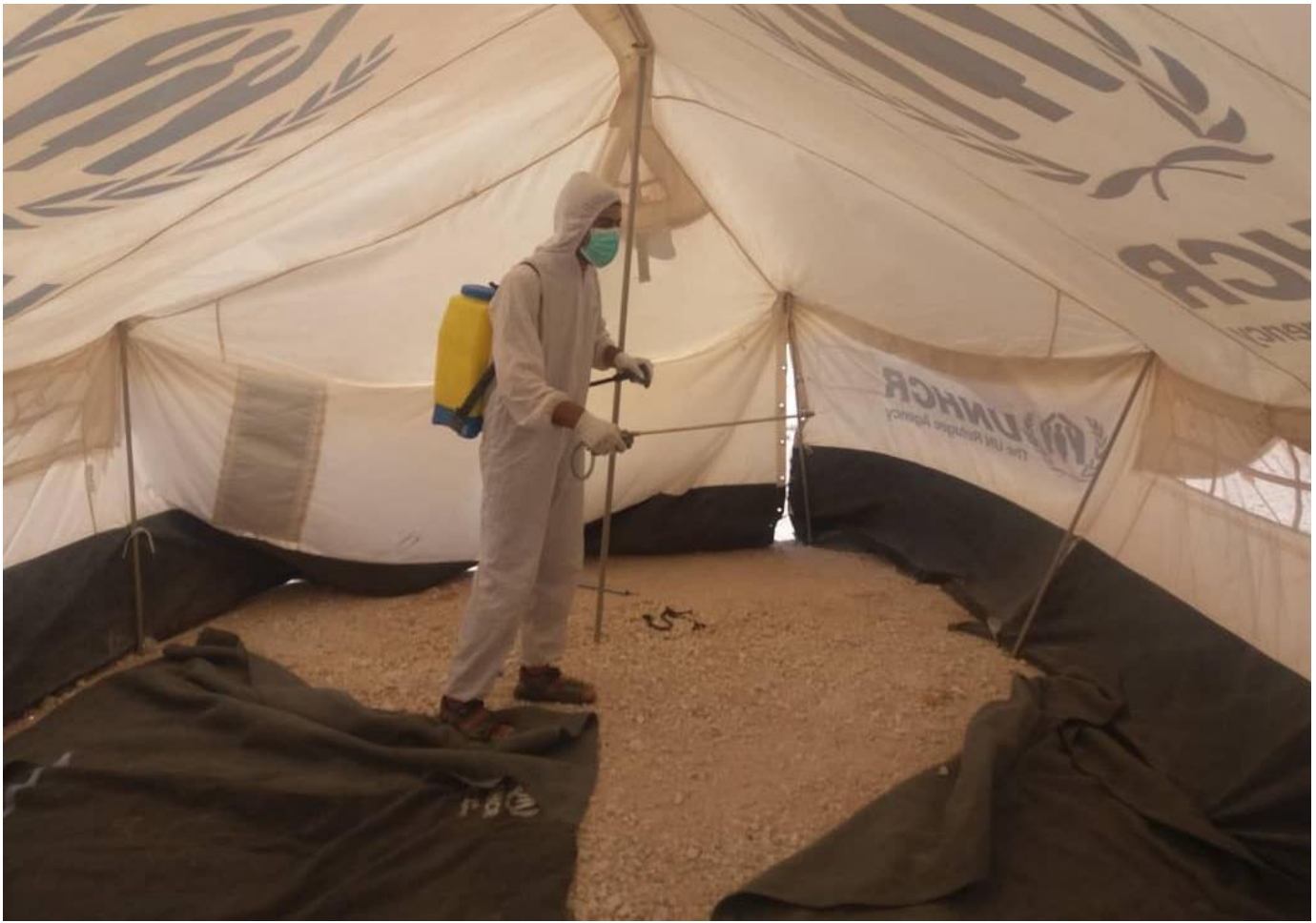
A health worker fumigates a UNHCR tent in Al-Hol Camp, Al Hasakeh Governorate, Syria. UNHCR.