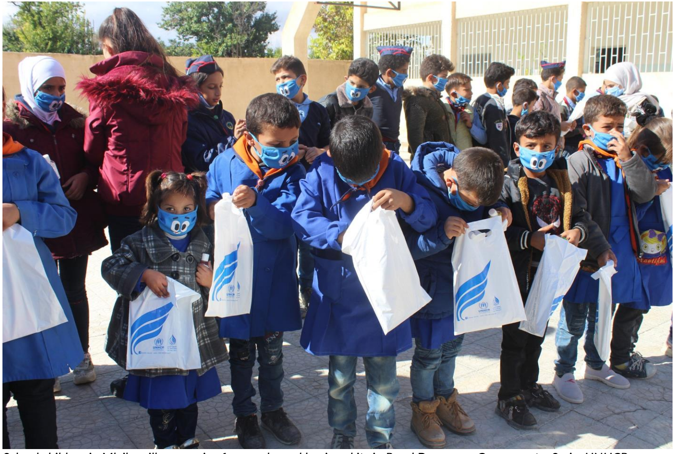
School children in Mleiha village receive facemasks and hygiene kits in Rural Damascus Governorate, Syria.