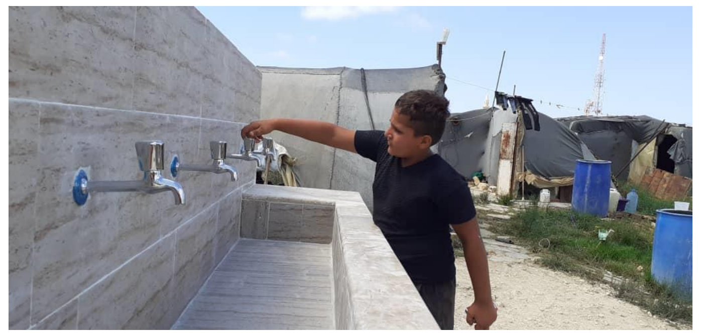
A Syrian IDP boy uses the newly installed communal hand-washing area in Al Hamediyeh Camp in Tartous Governorate, Syria.

By end-2020, the Ministry of Health announced the total number of registered COVID-19 cases had reached 11,344. Of this total, just under half (46.5%) had recovered and 704 had reportedly died. In the northeast of the country authorities reported that the number of cases had reached almost 7,000 by year-end.