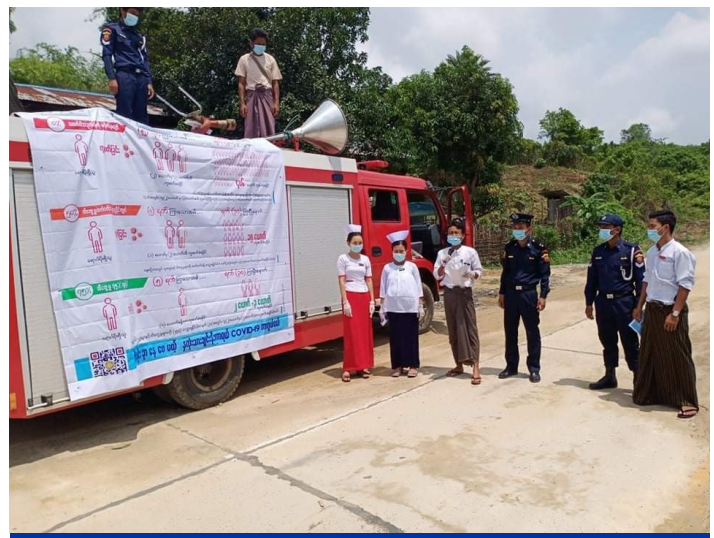
Dissemination of COVID-19 health messaging by Government Health Staff at Taung Pyo Village, Maungdaw Township, Rakhine State.

The Myanmar Embassy in Thailand is collecting the advance voting list of Myanmar nationals in Thailand, including of MOU migrants, in preparation for the upcoming elections.