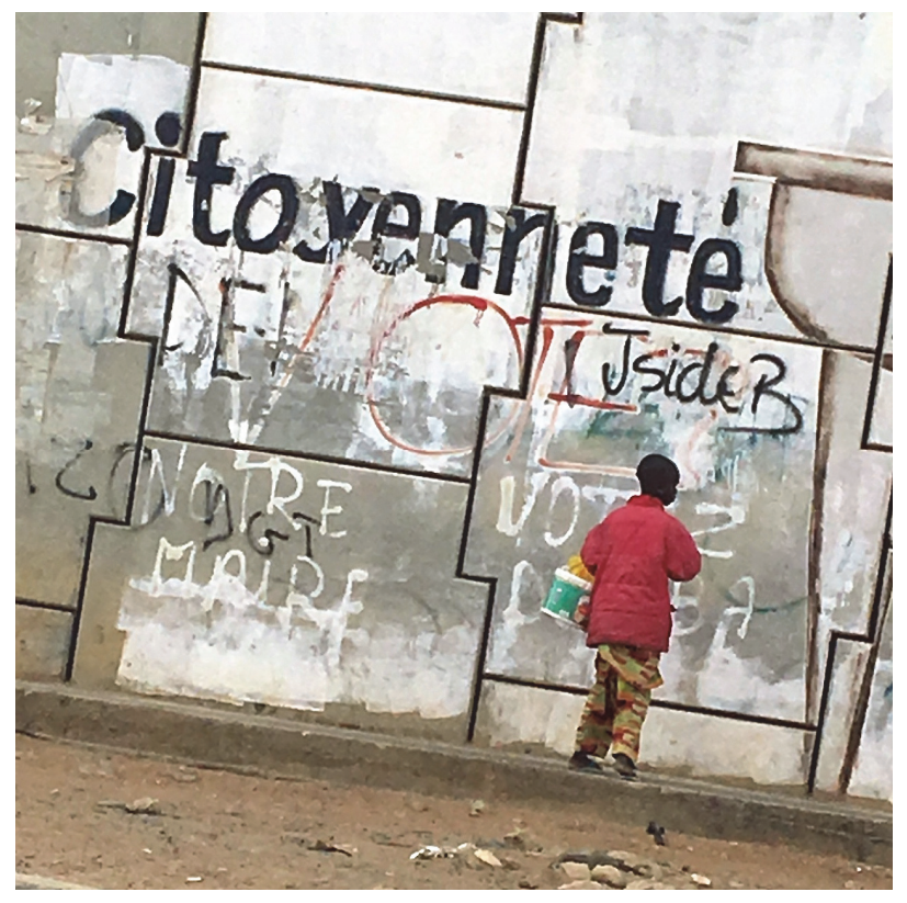
A talibé child near a major street intersection in Dakar, Senegal, June 19, 2018.

Finally, the international community should denounce ongoing abuses against talibé children; express support for an approach that equally prioritizes deterrence, social assistance, and public communication; and accompany the Senegalese government by providing financial, material or technical support to the priority areas identified in this report.