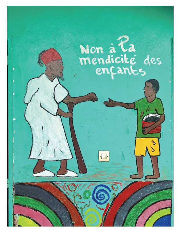
A painting on the wall of a children's day center run by the NGO Enda Jeunesse Action in Dakar, June 21, 2018. The text reads, in French, "No to child begging."

This report examines Senegal's policy, programmatic and judicial efforts from 2017 to 2019 to protect talibé children from abuse, neglect and trafficking, bring those responsible to justice, and improve conditions in daaras . It makes recommendations on steps the new government should take to better protect talibé children and bring about lasting change.