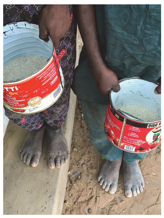
Two talibé children in Louga hold their begging bowls, which contain rice. The children said they begged daily for food and money. January 11, 2019.

No special police units for child protection exist outside of Dakar, and Departmental Child Protection Committees struggle with limited resources. Regional offices of "Non-Institutional Educational Action" ( Action éducative en milieu ouvert , AEMO) – a social services and legal assistance