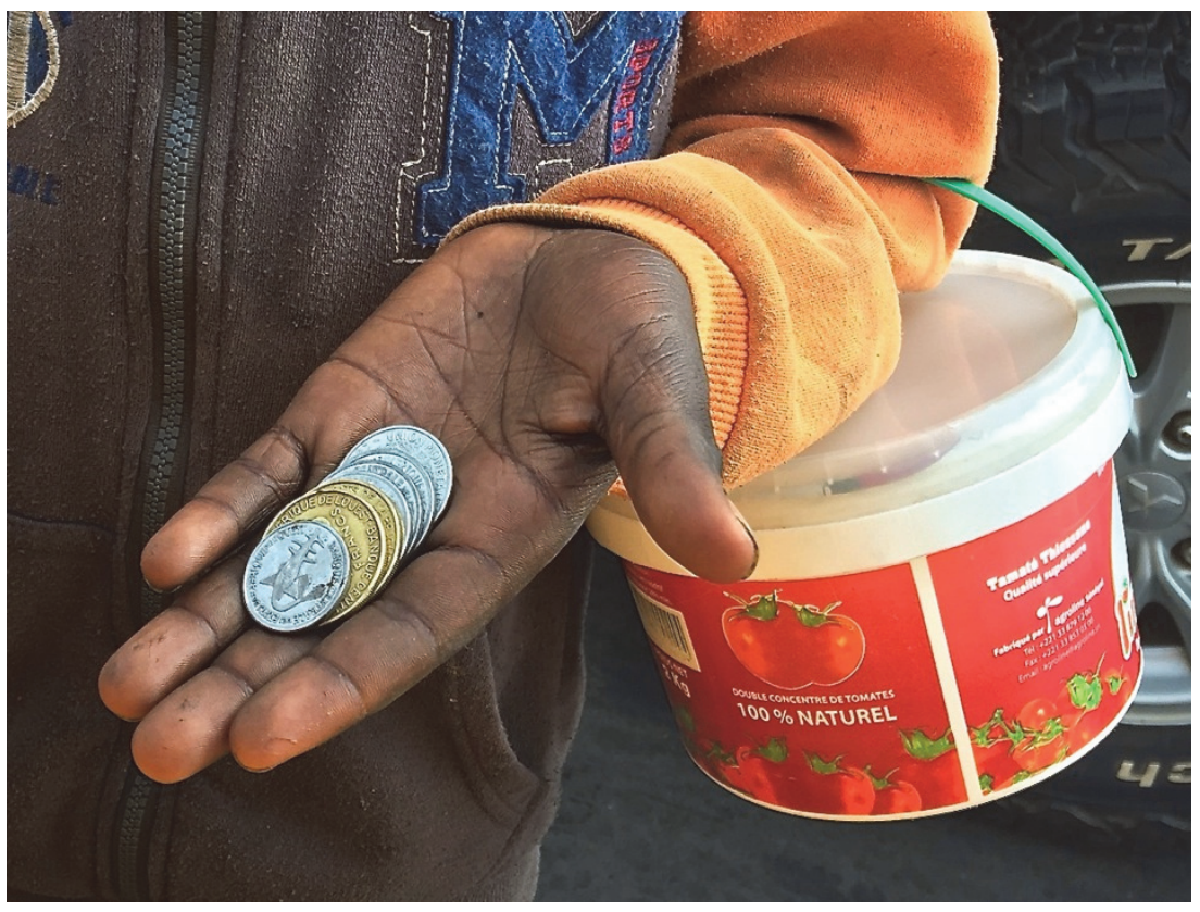
A talibé child begging at car windows in Dakar, June 19, 2018. Multiple talibés told Human Rights Watch that their Quranic teacher required them to return with a specific quota of money each day.