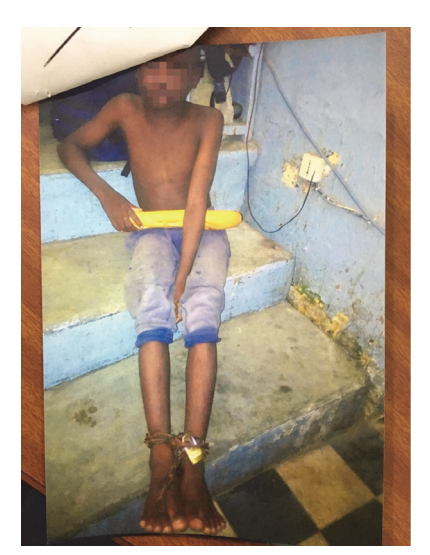
This 8-year-old talibé child ran away from his daara in Saint-Louis with chains still attached to his feet in August 2017. Original photo taken August 2017.

investigations, despite the fact that – with thousands of talibés begging in the streets – "it's exploitation in plain sight."<sup>116</sup>