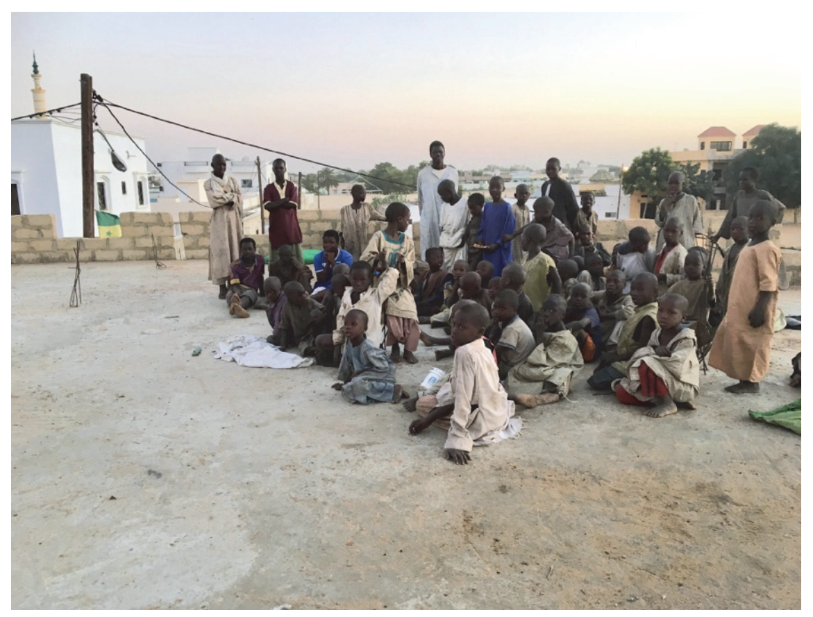
A group of talibé children on the rooftop terrace of a daara in Touba that housed over 100 talibés in a large, unfinished building with no paved floors. At night, the children either slept inside on sheets on the sand, or on the terrace, exposed to malaria-carrying mosquitos. January 8, 2019.

In Saint-Louis, where Human Rights Watch has visited dozens of squalid daaras since 2009, "there is a proliferation of daaras ," according to a staff member at a local children's center. "They come, they rent a house, and they install the children in conditions of extreme hardship. There is no effective system in place to eradicate this phenomenon," he said.<sup>53</sup>