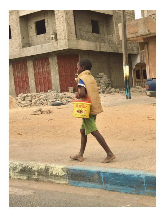
A talibé child in Dakar, Senegal, June 21, 2018.

Beyond the retrait program in Dakar, Senegalese police in multiple regions of Senegal often failed to initiate or pursue investigations into cases of forced begging or abuse against talibé children in 2017-2019. This dynamic and its detrimental effect on talibé children's access to justice is explored further in Section V of this report.