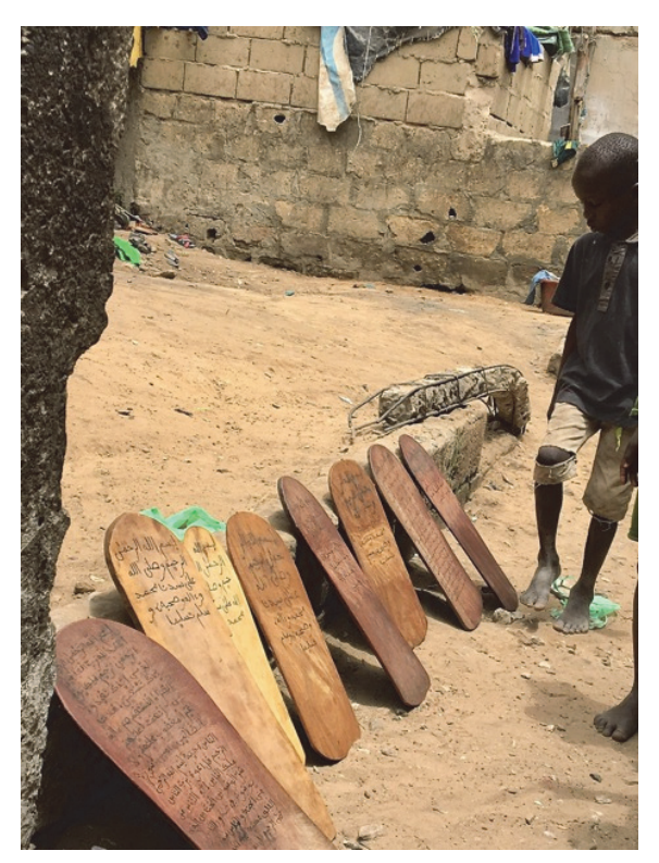
A talibé child looks at the tablets where the boys practice writing Quranic verses at a daara in Dakar, June 23, 2018. The children begged daily for money and all their meals.

In 2015, the Interior Ministry announced its intention to set up special "offices" to deal with cases concerning children in all central police stations. At time of writing no such offices had been established in other regions, though most police stations reportedly had one or more officers trained in child protection.<sup>71</sup> A government social worker in Diourbel said he had observed an improvement in police handling of children's cases following trainings: "More police are trained on the care of children now – how to receive them, put