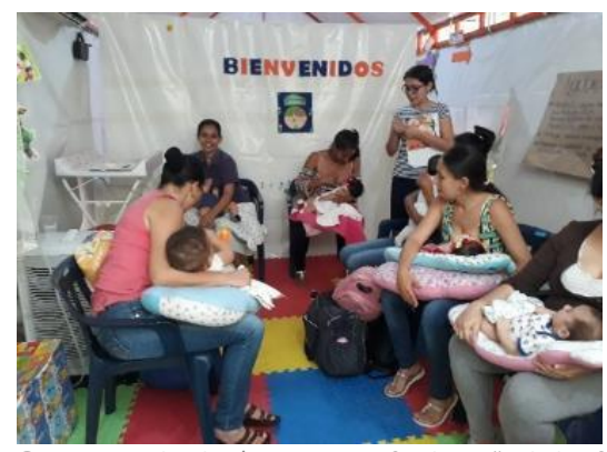
Breastfeeding, "A link of love". "Whoever invented this space invented heaven. We used to arrive at 5:00 in the morning and form a queue to get a ticket for the hospital, we had to sit on the ground to breastfeed our babies or rest. Now we arrive here happy at 7:00 am and wait together feeling solidarity and companionship", mother in Puerto Santander, Norte de Santander.

The six UNICEF-supported extramural health and nutrition teams continued to function in June (Arauca, Ipiales, Villa del Rosario, Uribia, Maicao and Cesar departments), providing services for 4,141 people, 60 per cent of them children. A total of 91 cases of children under five at risk of malnutrition were identified and received nutritional growth monitoring support, counselling on adequate feeding and case follow-up. Eleven children with moderate acute malnutrition (MAM), 4 girls and 7 boys, were identified and received treatment with Ready-to-Use-Therapeutic-Food (RUTF); two boys presented severe acute