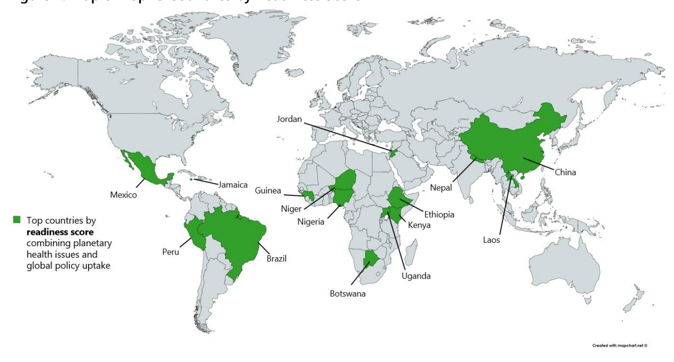
Figure 2: Map of Top 15 Countries by Readiness Score

Fifteen countries ranked the highest after combining the issue and policy scores. These countries are listed below in order of readiness score, from high to low, and the geographic spread is illustrated on the following map.