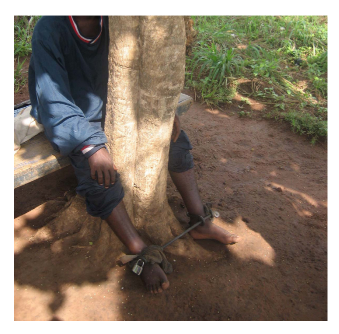
Figure 2 Chains in use in a prayer camp.