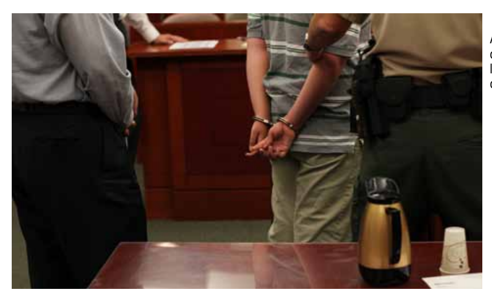
Adolescents with conduct disorder are responsible for a large part of the crime in most communities.