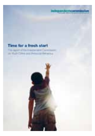
Click on the picture to access the UK Independent Commission on Youth Crime and Antisocial Behaviour' 2010 report Time for a fresh Start .