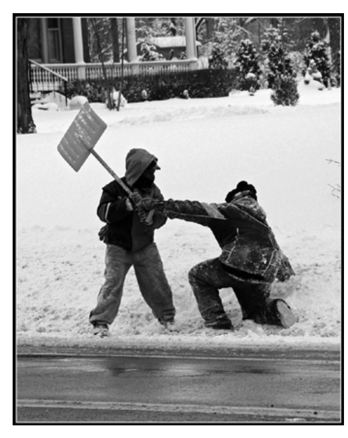
Conduct disordered children often become involved in physical fights.

ICD-10 recommends that multiaxial assessment be carried out for children and adolescents, while DSM IV-R suggests it for all ages. In both systems, axis one is used for psychiatric disorders, which have been discussed above. The last three axes in both systems cover general medical conditions, psychosocial problems, and level of social functioning respectively; these topics will be alluded to below under aetiology. In the middle are two axes in ICD-10, which cover specific ( Axis two ) and general ( Axis three ) learning disabilities respectively; and one in DSM IV-R ( Axis two ) which covers personality disorders and general learning disabilities.