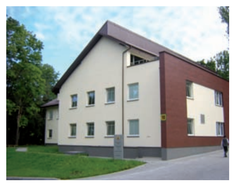
Vasaros Hospital before and after the renovation

movement that could enhance transition of Lithuanian psychiatry towards modern social psychiatric community-based services. Also we hope that this example might be useful for other countries, especially with similar cultural and historical experiences.