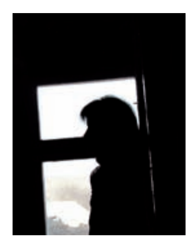
The photographs in this article were taken by boys released from Orhei Institution for People with Mental Disabilities

in Lithuania. This group included 5,217 adults in adult facilities and 878 children living in social care institutions for children and young people with mental disabilities. By January 1, 2005, there were 5349 persons (2882 male and 2467 female) and 659 children (373 boys and 286 girls)<sup>4</sup> in state social care homes. For every 10,000 population, there were 15.3 placed in social care homes.<sup>5</sup>