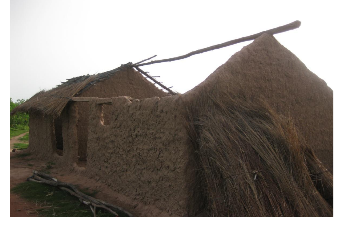
Appendix 3 (a) A new house under construction for a displaced family.