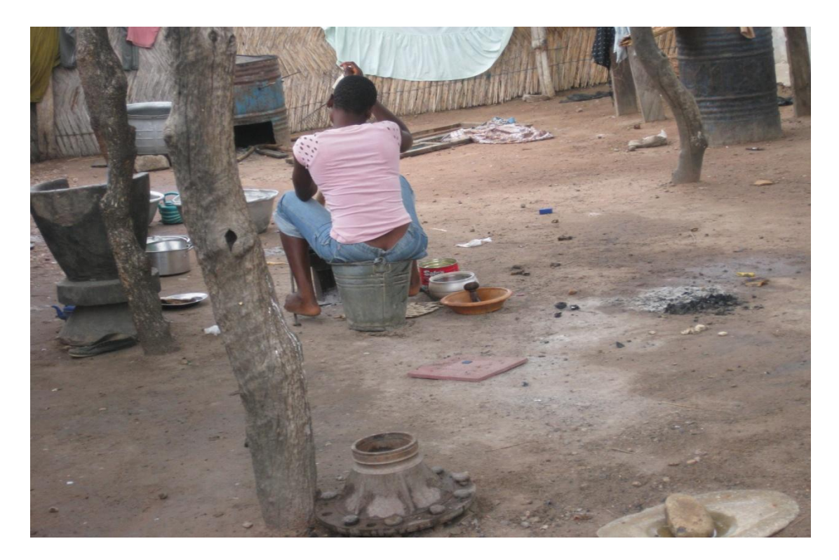
Appendix 3 (c) A displaced girl preparing meals for the family