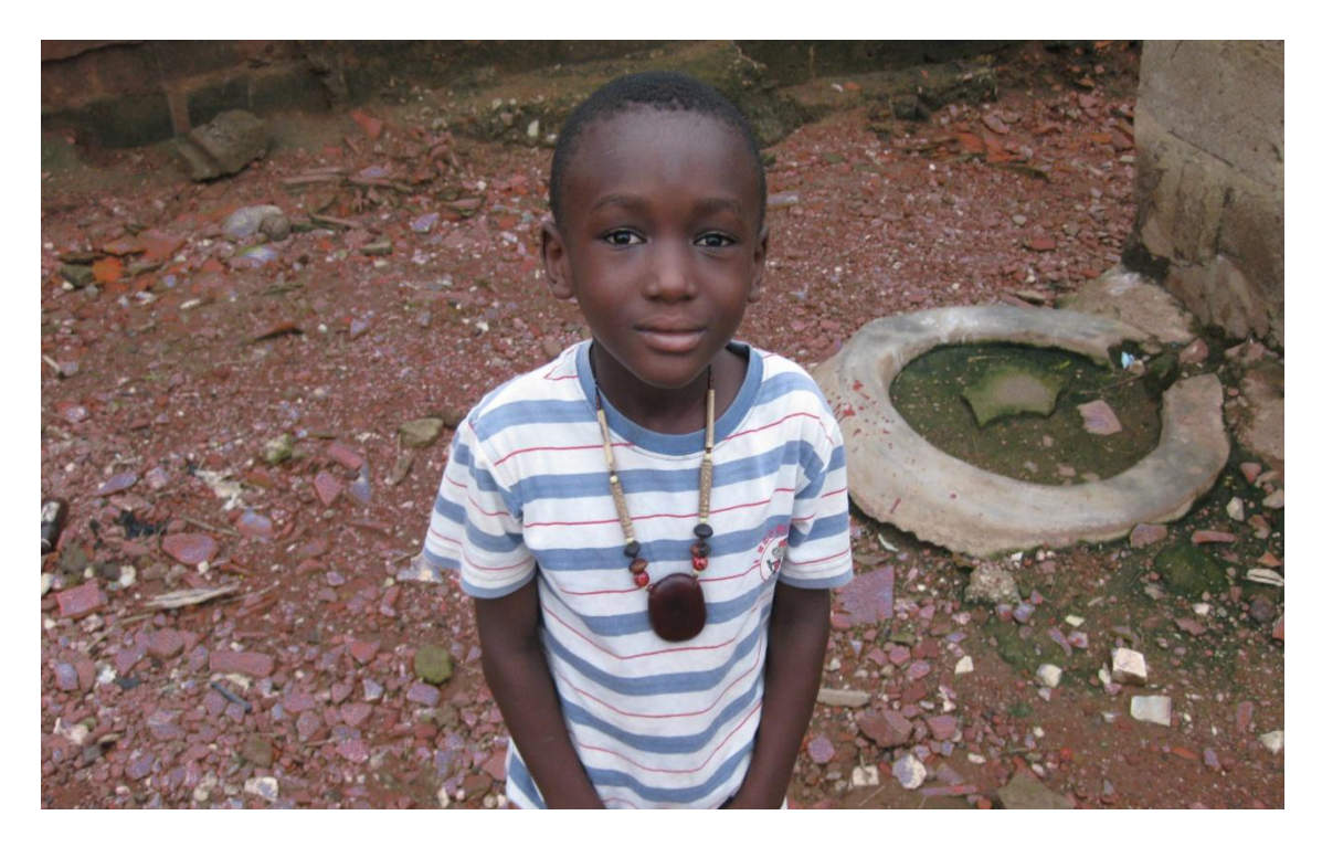
Appendix 3 (d) A boy wearing a talisman.