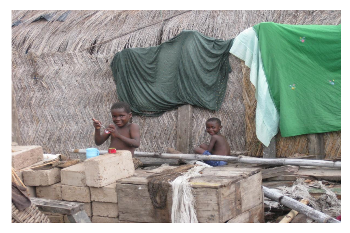
Appendix 3 (b) some of the displaced children