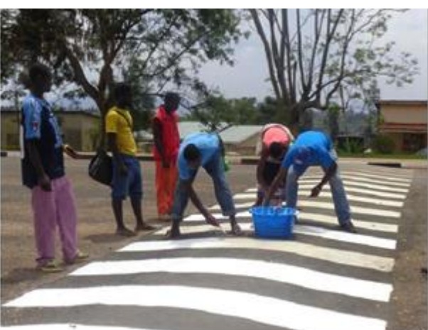
International Deaf Awareness Week activities 2014