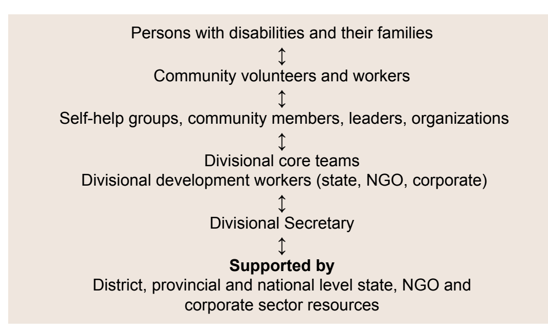
Figure 2: Management of the community-based rehabilitation programme

The management of the CBR programme is illustrated in Figure 2.