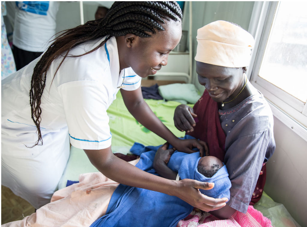
An IOM midwife attends to a mother and her newborn at the Malakal PoC site.

As the conflict in South Sudan enters its fifth year, humanitarian conditions across the country remain dire and food insecurity has reached record levels. In 2018, an estimated 7 million people will be in need of relief assistance. By the end of 2017, 1.9 million people remained internally displaced and an additional 2.1 million people – an increase of 75 per cent from 2016 – had fled to neighbouring countries. To respond to these expanding needs, aid agencies, including IOM, are appealing for USD 1.7 billion to provide assistance to 6 million people through the 2018 Humanitarian Response Plan .