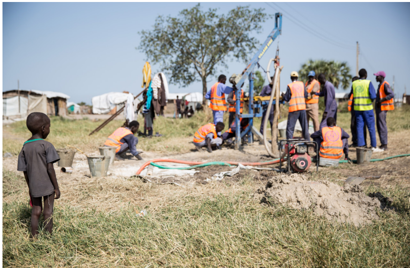
IOM conducts manual borehole drilling in Bentiu town.

Since the cholera outbreak began in June 2016, over 21,500 cases have been reported, including 462 deaths, in 27 counties across South Sudan. IOM health and WASH teams continue to respond in affected areas. A health RRT conducted an oral cholera vaccination (OCV) campaign in Budi County, Eastern Equatoria, from 15 to 24 November, targeting 147,000 people. Since July 2017, more than 850 cholera cases were reported in Budi. Following the campaign, there have been no new reported cases since 3 December. The IOM RRT also conducted the second round of an OCV campaign in Tonj East County, Warrap, from 9 – 16 December, targeting 170,000 people.