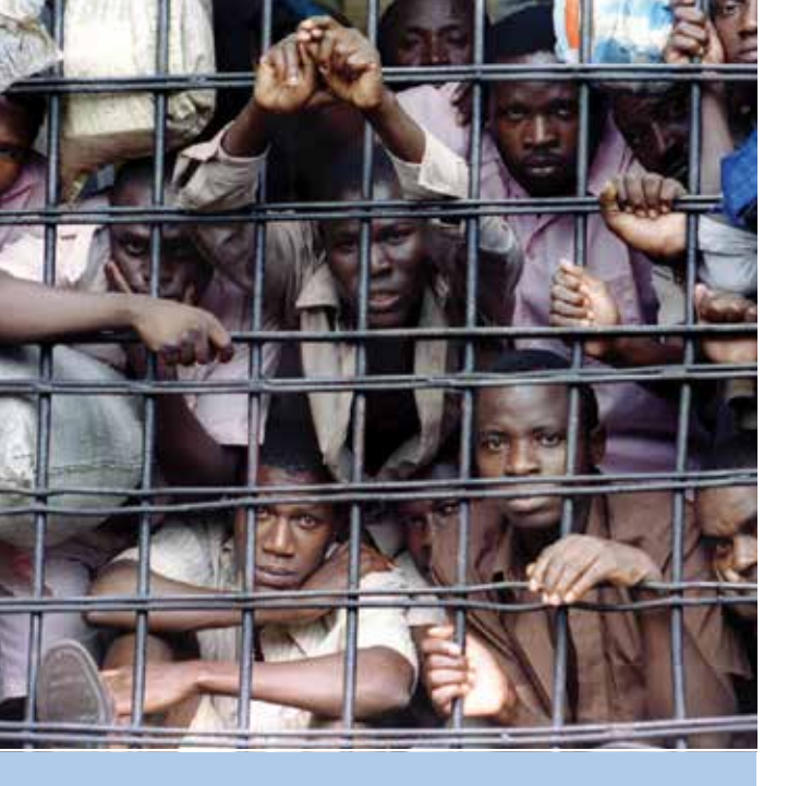
Aid efforts help facilities such as Gitarama Central Prison in Kigali, Rwanda, which is designed to house 500 prisoners, but at one time held up to 6,000, and where one in eight prisoners dies of disease or violence.