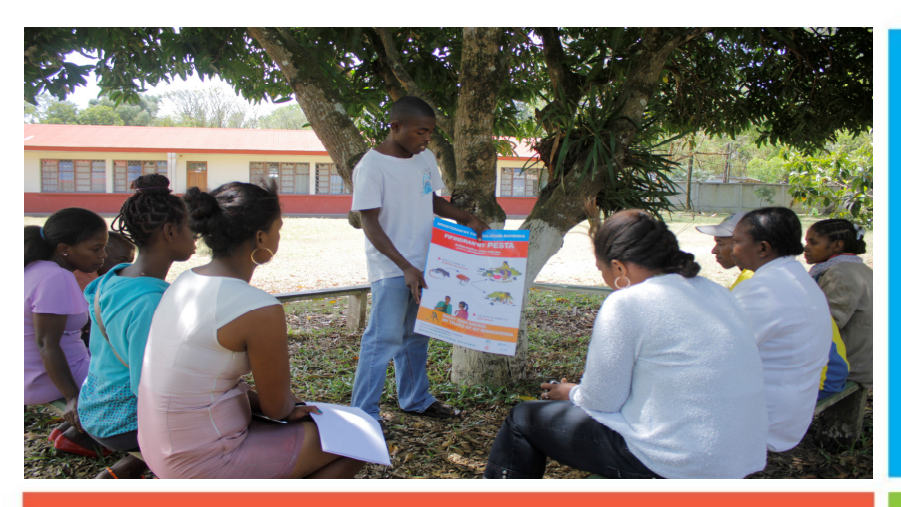
A UNICEF supported plague sensitization session in Tamatave