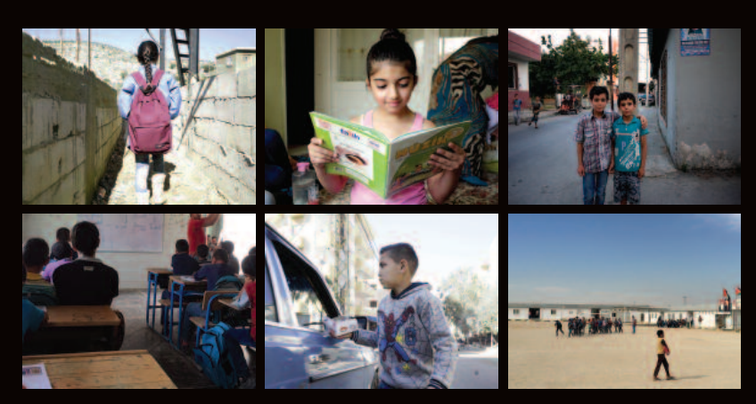
Syrian children and schools in Turkey, Lebanon, and Jordan.

The report identifies shortcomings in donors' transparency, and demonstrates why addressing these concerns is needed to realize refugee children's right to an education.