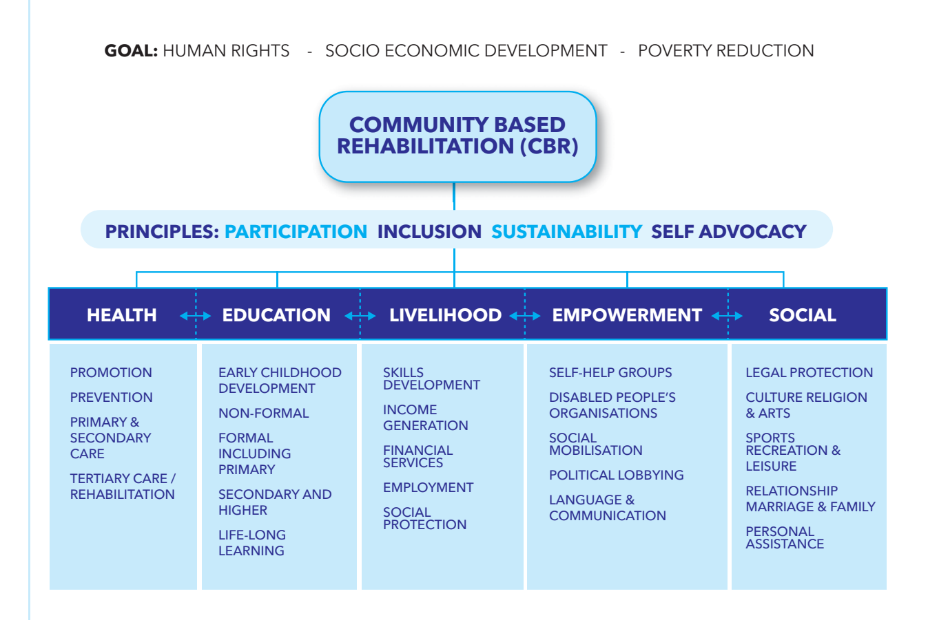
Figure 1.1: CBR Matrix<sup>10</sup>

Each of the five components of the CBR matrix has five sub-themes. The CBR has been used in this study as a framework for the situation analysis of children with disabilities, and four of the five sub-themes are discussed in turn.