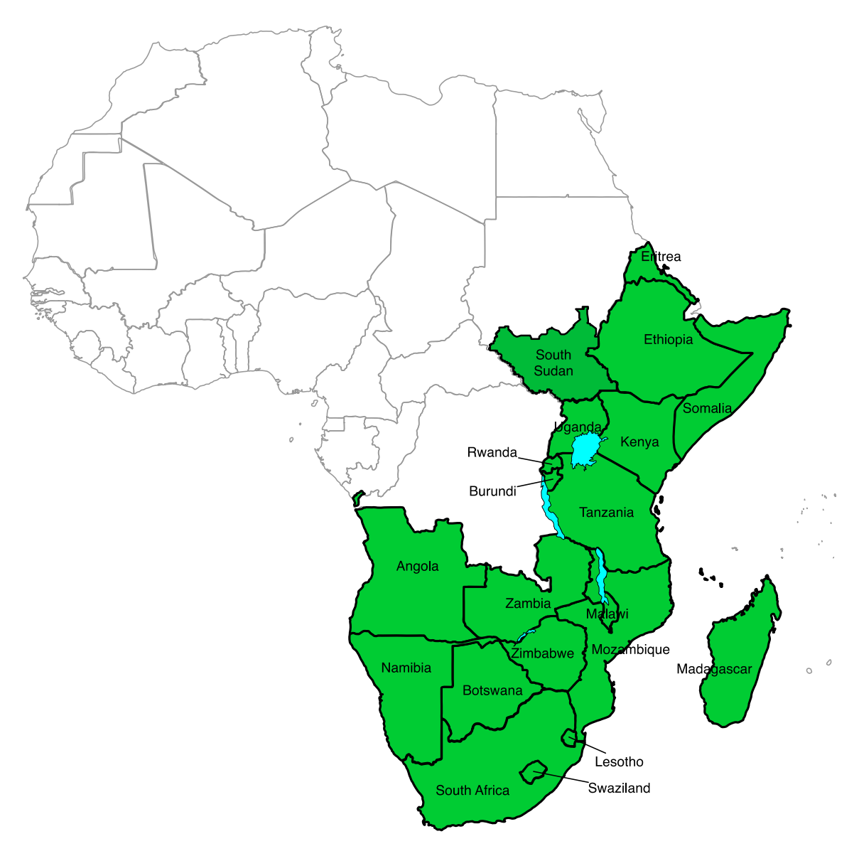
Map 1: Countries in the UNICEF East and Southern Africa region