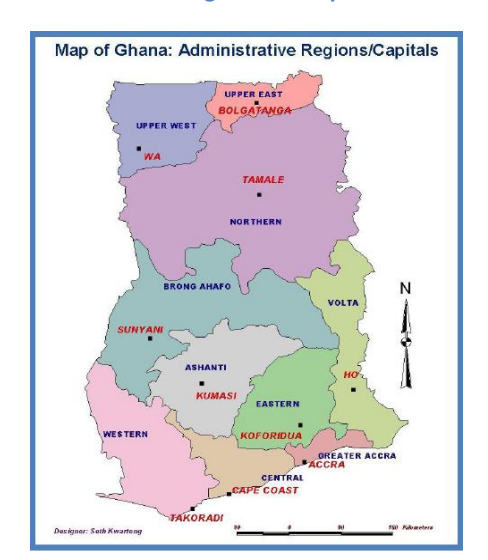
Figure 2: Map of Ghana: Administrative Regions and Capitals

The country is divided into ten administrative regions and 170 decentralized districts. The government is a presidential democracy with an elected parliament and independent judiciary.