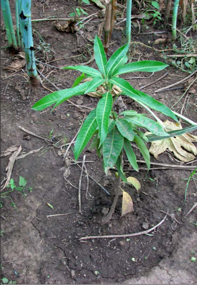
Young tree growing in an ArboLoo pit.

With a population of over 78 million, Ethiopia still counts many households in need of assistance. The Government of Ethiopia does not endorse subsidies for sanitation and therefore households must purchase slabs and pay other building costs. Many private artisans have been trained to make the small slabs for the ArborLoo, but materials are often hard to come by. Project partner organizations still have to assist in getting materials, and often have to cover