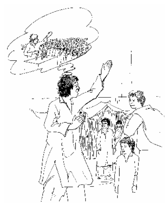
finishing what he is saying. If the person has severe mania, then it is not possible to follow what he is saying or understand him.

A period of mania may only last for a few days but in the worst cases, if left untreated, it goes on for months and the patient can die from exhaustion or accident. Sometimes someone may become manic only once in his entire life, but it is more likely that there will be several episodes with intervals of normal mental health in between. A manic episode can be followed by depression but that is not always so.