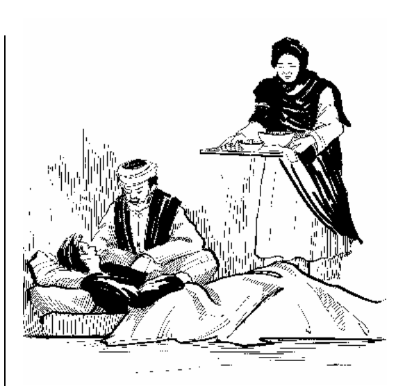
him that the symptoms will stop after about one week.

The physical symptoms will last for 7–10 days and will be like a very bad case of 'flu'. The person will sweat, shiver, ache everywhere, vomit and have diarrhoea. Chlorpromazine 50mg 3 times a day given for 5 days can help with these physical symptoms. It should not be administered too often or after the first 7 days. The person needs to be supervised during the withdrawal period, encouraged and have food brought to them. Assure