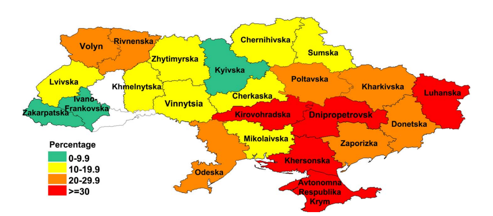
Figure 2 Percentage of new TB cases with MDR-TB by region. Western zone: Chernivitsi, Ivano-Frankovsk, Khmelnistki, Lviv, Rivne, Ternopil, Volyn and Zakarpattia oblasts . Central zone: Cherkasy, Chernihiv, Kiev, Kirovohrad, Poltava, Sumy, Vinnytsia and Zhytimyr oblasts . South-Eastern zone: Crimea Autonomous Republic and Dnipropterovsk, Donetsk, Kharkiv, Kherson, Luhansk, Mikolaiv, Odessa and Zaoporozhia oblasts .

TB = tuberculosis; CI = confidence interval; MDR-TB = multidrug-resistant TB.