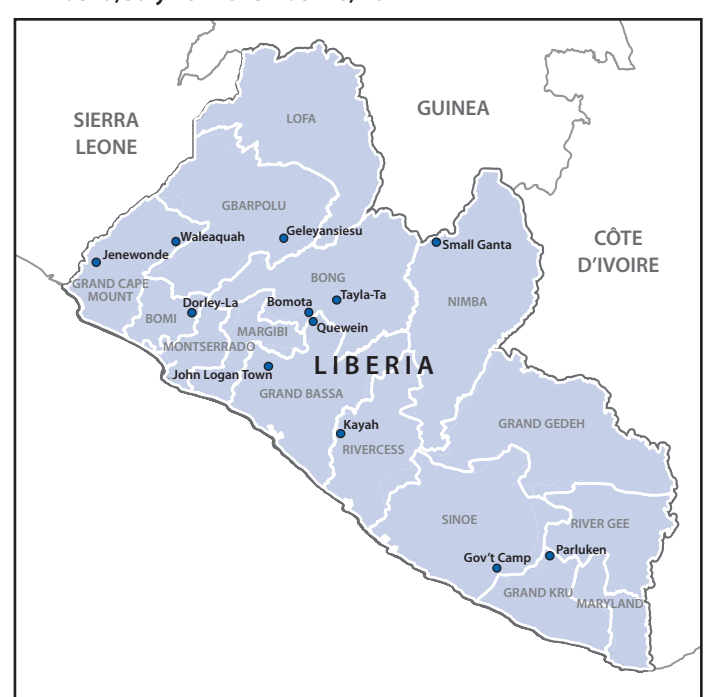
FIGURE 1. Locations of 12 Ebola outbreaks in remote communities — Liberia, July 16–November 20, 2014

The median time between symptom onset in the index patient and an alert received by the CHT was 33 days