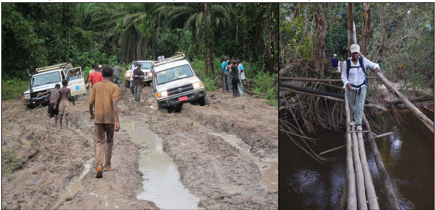
FIGURE 3. Challenges facing Ebola teams traveling to remote communities in Liberia have included impassable roads such as this one on the way to John Logan Town (left) and difficult river crossings such as this one on the way to Bomota (right)

Interventions in the 12 outbreaks included 1) engagement of traditional and community leaders in response activities; 2) community education about Ebola virus transmission and prevention; 3) active case finding, contact tracing and monitoring; 4) quarantine of asymptomatic high risk contacts at home or in designated quarantine facilities; 5) isolation and treatment of patients; and 6) safe burials. In each community, the appropriate level of intervention was determined by the community's requests, the number and severity of cases, the remoteness and accessibility of the community, and the distance to Ebola treatment facilities. Resistance to assistance was encountered in several communities, and response was suspended until discussions with county and traditional officials or the increasing burden of cases and deaths encouraged community acceptance of intervention. In two outbreaks (Kayah District, Rivercess and Quewein, Grand Bassa), the availability of nongovernmental partners to rapidly establish isolation and treatment facilities permitted on-site or nearby care of patients. In these and other outbreaks, some patients were able to reach ambulances at the closest road access point and were taken to established ETUs. In one outbreak (Jenewonde, Grand Cape Mount), delays in the establishment of an isolation and treatment facility resulted in only one patient being cared for in the facility before the outbreak was over.