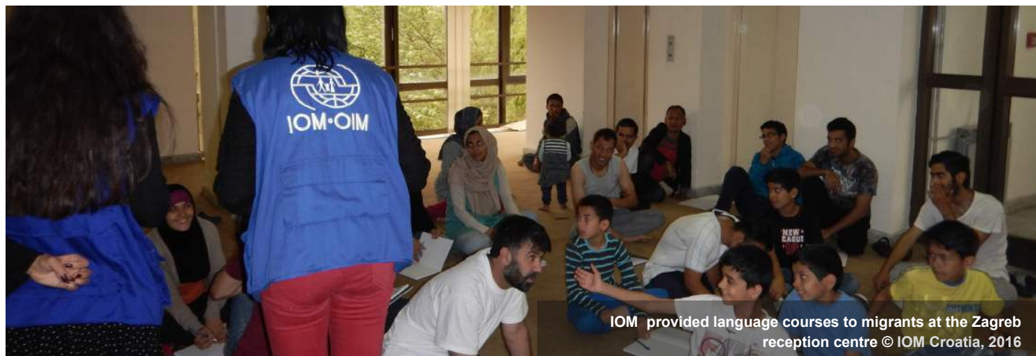
IOM provided language courses to migrants at the Zagreb reception centre

As part of its information and awareness campaign, IOM organized a three-day cultural festival in Agadez. The objective was to raise awareness and increase access to information about migration for transiting and potential migrants, host population and migrants living in the city, so that they are aware of safer alternatives to irregular migration towards Algeria and Libya. The festival opened at the IOM transit centre with a video screening exploring migration in Niger and the region. Other activities included a football match in the town square between a migrant team and young people from Agadez, and an evening of participatory theatre to encourage discussion around informed decisions about migration and safer alternatives.