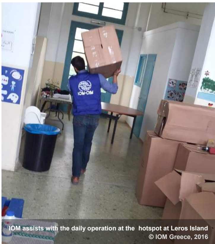
IOM assists with the daily operation at the hotspot at Leros Island

IOM, in coordination with the First Reception Service continues to operate the open reception centre in Athens which provides accommodation and direct assistance, including psychosocial and medical aid, to vulnerable migrants wishing to return to their country of origin. To date, the centre has provided assistance and accommodation to a total of 644 migrants, of which, 505 have returned to their country of origin.