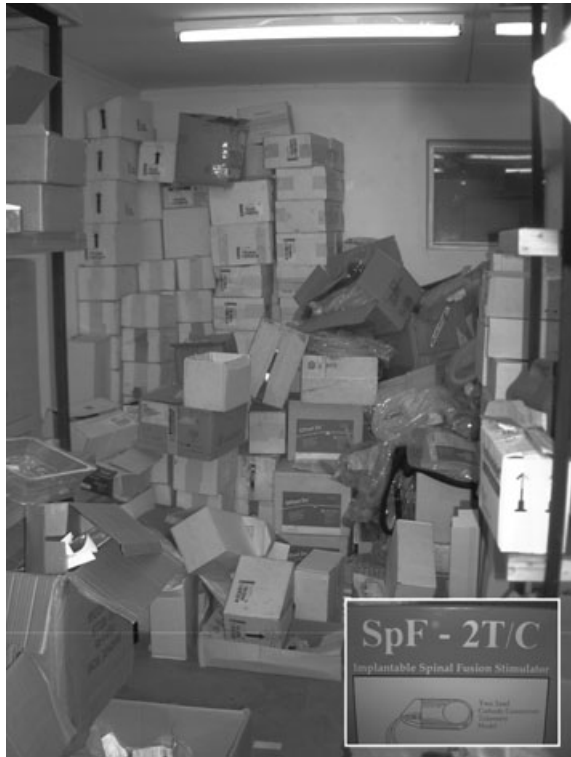
Figure 3 A mountain of ECG electrodes threatens to block the anaesthetic store room door, with an example of other inappropriate donated equipment (inset).

anaesthesia in the past 30 years, but it remains largely unavailable in poorly resourced countries. The survey of Hodges et al. showed that in Uganda, 74% of anaesthetists currently work without oximetry [1]. This simple non-