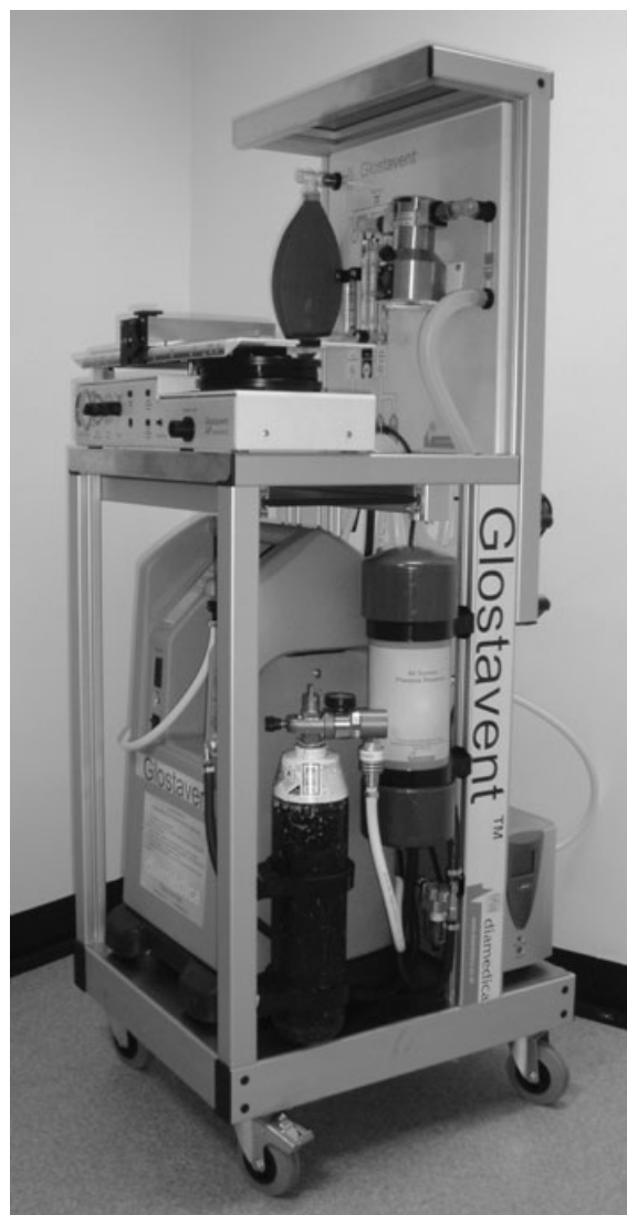
Figure 2 The Glostavent.

In small hospitals, maintenance facilities are rarely available and ideally equipment should be designed to permit a